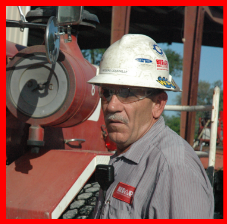
Rogers in action on a recent job.